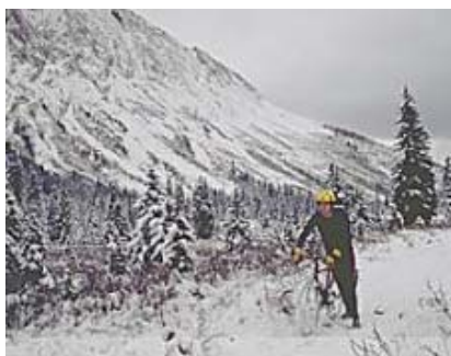
Below, Two of Ward's Popular Books

Ward's web site, MountainNature.com, is the largest online guide to the plants, animals, birds and landforms of the Rockies. It is recommended by Canadian Geographic Magazine, Kananaskis Country, the Federation of Alberta Naturalists, the Green Pages, and the Global Outdoor and Environmental Education Council.